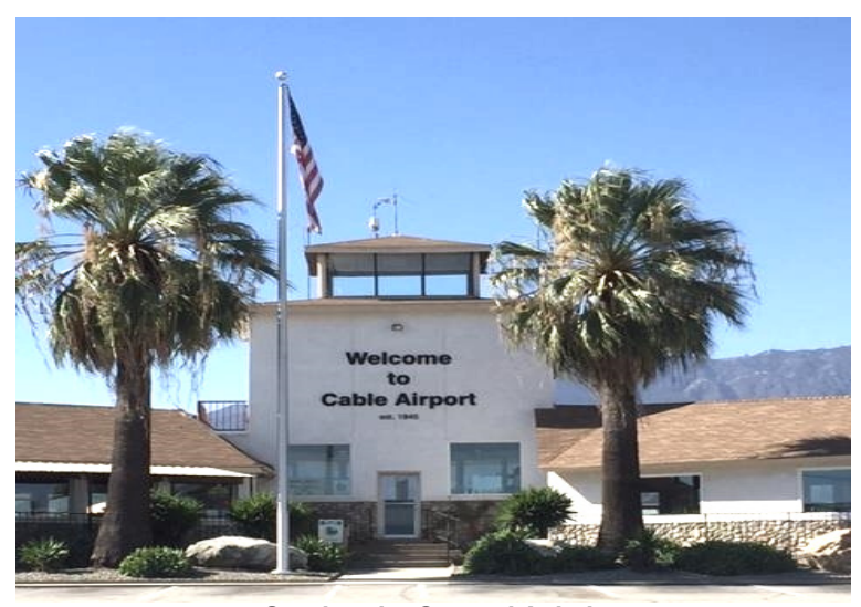
Serving the General Aviation Community over 70 years

Cable Airport 1749 W. 13th Street (13th & Benson) Upland, CA. 91786-2199 909-982-6021 www.cableairport.com