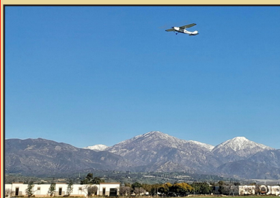
"Great day for a First Tower Solo in 5E5! Couldn't ask for a better view from the sky!"