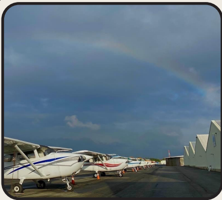
Sunny Days and More Flying!